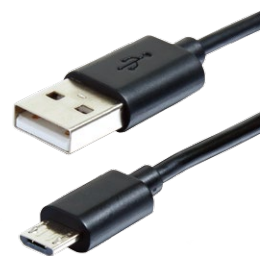
USB A to Micro B cable

Material PVC Cable type Round Working output 2A Connector Micro USB Moulding head