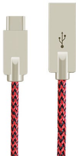
Type-C to USB Charging Cable