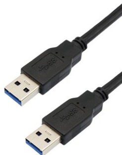
USB 3.0 Male A to Male A Cables

Transfer rate up to 4.8 Gbps Foil and braid shielded to reduce EMI/RFI interference Twisted pair construction helps reduce crosstalk 28 AWG copper conductors Backwards compatible