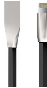
USB to Lightning Cable