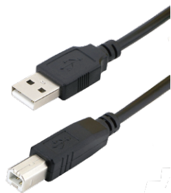
USB 2.0 Male A to Male B Cables

Transfer rate up to 480 Mbps Foil and braid shielded to reduce EMI/RFI interference Twisted pair construction helps reduce crosstalk 28 AWG copper conductors Backwards compatible