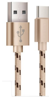
Type-C to USB Charging Cable