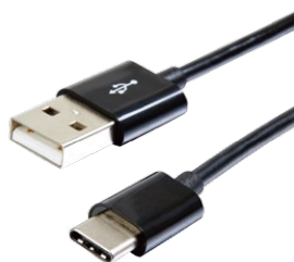
USB A to Type C cable

Material TPE Cable type Round Working output 2A Connector Type C Moulding head