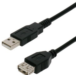
USB 2.0 Male A to Female A Cables

Transfer rate up to 480 Mbps Foil and braid shielded to reduce EMI/RFI interference Twisted pair construction helps reduce crosstalk 28 AWG copper conductors Backwards compatible