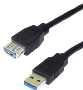
USB 3.0 Male A to Female A Cables

Transfer rate up to 4.8 Gbps Foil and braid shielded to reduce EMI/RFI interference Twisted pair construction helps reduce crosstalk 28 AWG copper conductors Backwards compatible