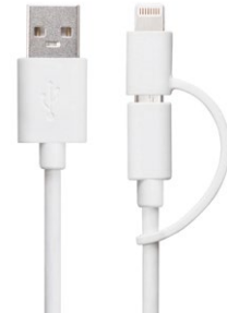
2 in 1 USB Charging Cable