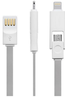
2 in 1 USB Charging Cable