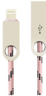
USB to Lightning Cable