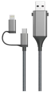
2 in 1 Smart Charging USB Cable