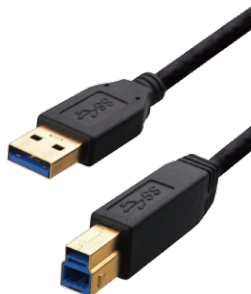
USB 3.0 Male A to Male B Cables

Transfer rate up to 4.8 Gbps Foil and braid shielded to reduce EMI/RFI interference Twisted pair construction helps reduce crosstalk 28 AWG copper conductors Backwards compatible