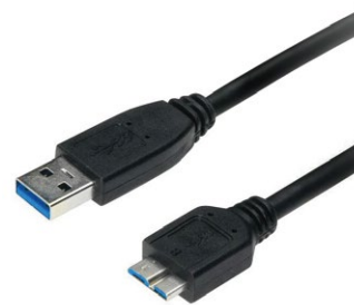
USB 3.0 Male A to Micro B Male Cables

Transfer rate up to 4.8 Gbps Foil and braid shielded to reduce EMI/RFI interference Twisted pair construction helps reduce crosstalk 28 AWG copper conductors Backwards compatible