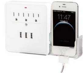
3 AC Slots +3 USB Ports