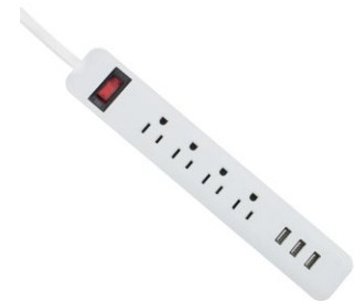
4 outlets with 3 USB Ports Power Strip