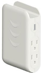
4 AC Slots +2 USB Ports