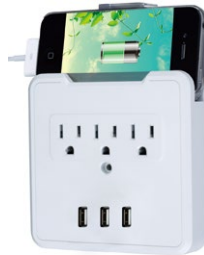
3 AC Slots +3 USB Ports