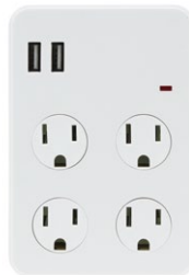
4 outlets +2 USB Ports current tap